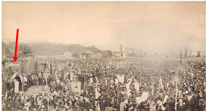
Celebration after slavery was banned in 1888. Princess Isabel can be seen on the left-hand side. [1]

One year later and after a short war for independence, Brazil declared itself an independent country. Dom Pedro I assumed the title of Emperor of Brazil. No constitution was created, no new rights were granted, and slavery continued to exist. In this case, the criollos and the Roman Catholic Church dominated the independence movement. Anyone who was a slave or of a lower social class (mulattoes, Native American Indians, and Africans), was not involved with the independence movement and therefore was not given any rights or responsibilities in the new government.