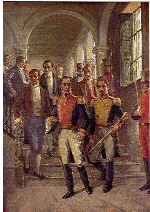
Simon Bolivar (center) at the Congress of Cúcuta in 1821 [1]

Venezuela, along with neighboring countries, was free. During the fighting, mulattoes, mestizos, and Native American Indians joined the fighting for independence. However, after independence was achieved, the criollos, a person of pure Spanish descent born in Spanish America, refused to change the social structure. The Roman Catholic Church, usually very conservative and supported by Spain, initially suffered from the wars. However, after Venezuela recovered from the wars, the Roman Catholic Church began to take a more active role in Venezuela.