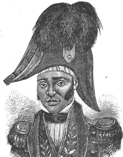
Jean Jacques Dessalines became Haiti's first emperor in 1804. [1]

During this revolutionary period, mulattoes and slaves played an enormous role in fighting for independence. At this time, 98% of the population was African or of mixed ancestry. As a result, their impact on the independence was monumental. Without these groups, the revolution would have never succeeded.