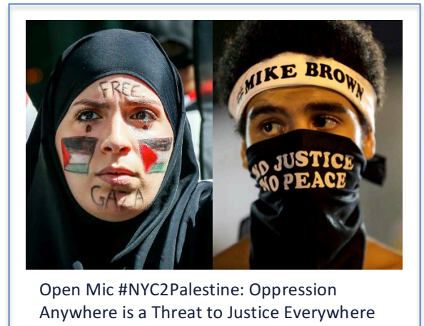
Open Mic #NYC2Palestine: Oppression Anywhere is a Threat to Justice Everywhere

c. Protests against police violence and racism: Look for quotes in Handout B where you have written 5 (to the left). Then imagine what King might have said about the various kinds of actions people have taken to protest since the police killing of Michael Brown, an unarmed young black man, in Ferguson, Missouri. How do King's ideas about the police violence, riots, protests that disrupt government and business apply to these actions? Also, consider the increased use by police departments of military tactics and equipment and solidarity shown between protestors in the U.S. and those under military attack in other countries. Do any of King's words suggest that he would have agreed with such a connection? Explain.